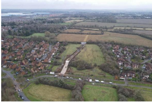
H10 Extension (Bletcham way)