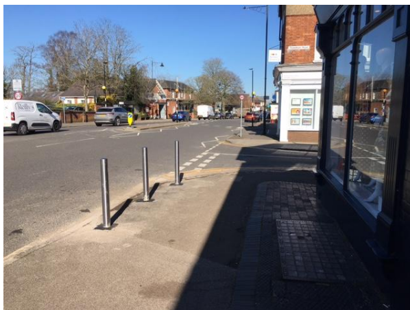
Bollards Outside Tesco