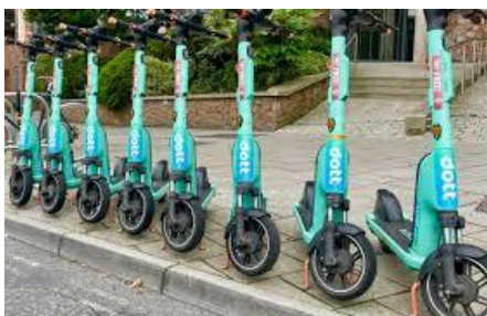
Milton Keynes E-scooter Forum Update

More information also available here: https://gallagherdevelopments.com/